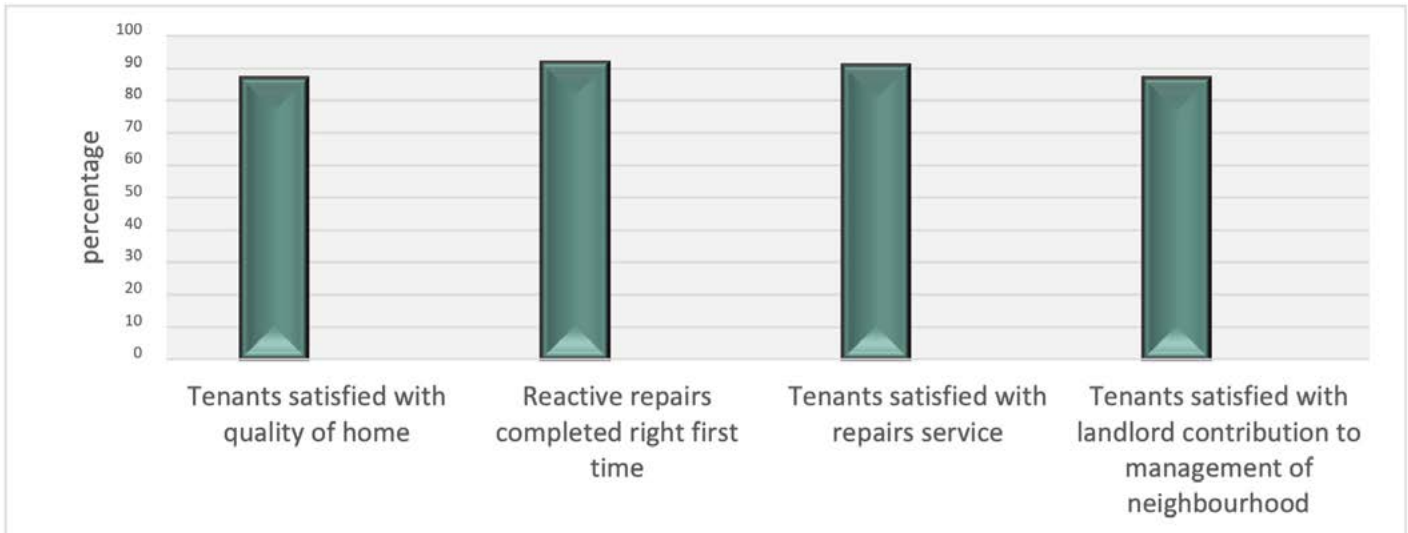
Figure 4.1: Social tenant satisfaction with quality of home and services, average 2016/17-2020/21

There is a great deal of uncertainty around how landlords will manage and finance work to deliver greener homes and how this might impact on tenants. A lot will rest on how the Scottish Government respond to the ZEST report 42 . In the meantime, social landlords may want to reflect on lessons from the Scottish Human Rights Commission (SHRC) work in Leith 43 . It used a human rights approach to secure greater participation of residents in efforts to improve their homes. It suggests that: